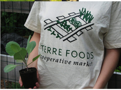
Terre Foods logo and brand applications 2008-2015.

While the original logo served Terre Foods well in its early days, it presented challenges when applying it to new uses. The typeface was too light, the colors not bold enough and the elements required a large visual space to be readable. Time to think "store!"