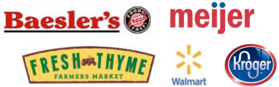
Examples of our competition's logos.

While the original logo served Terre Foods well in its early days, it presented challenges when applying it to new uses. The typeface was too light, the colors not bold enough and the elements required a large visual space to be readable. Time to think "store!"